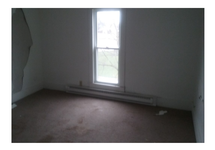
Take out carpet throughout house and restore floors.