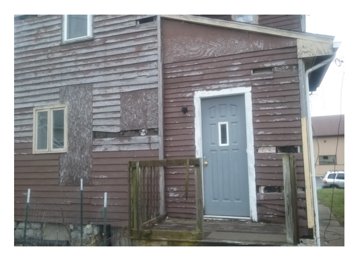
External damage needs repaired.