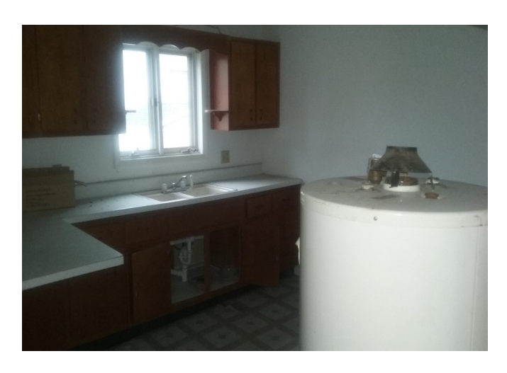
Restore kitchen and floors.