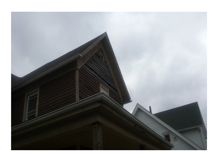
Repairs and vinyl siding .