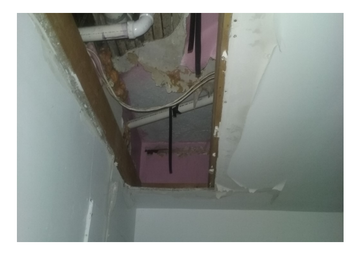
Ceiling damage needs repaired.

Interior walls throughout need repaired.